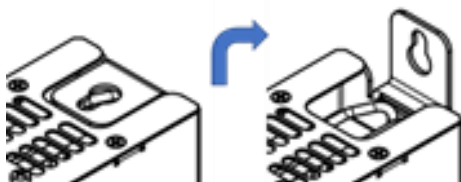
Figure 2 - Opening flip-flange for mounting plate fastening